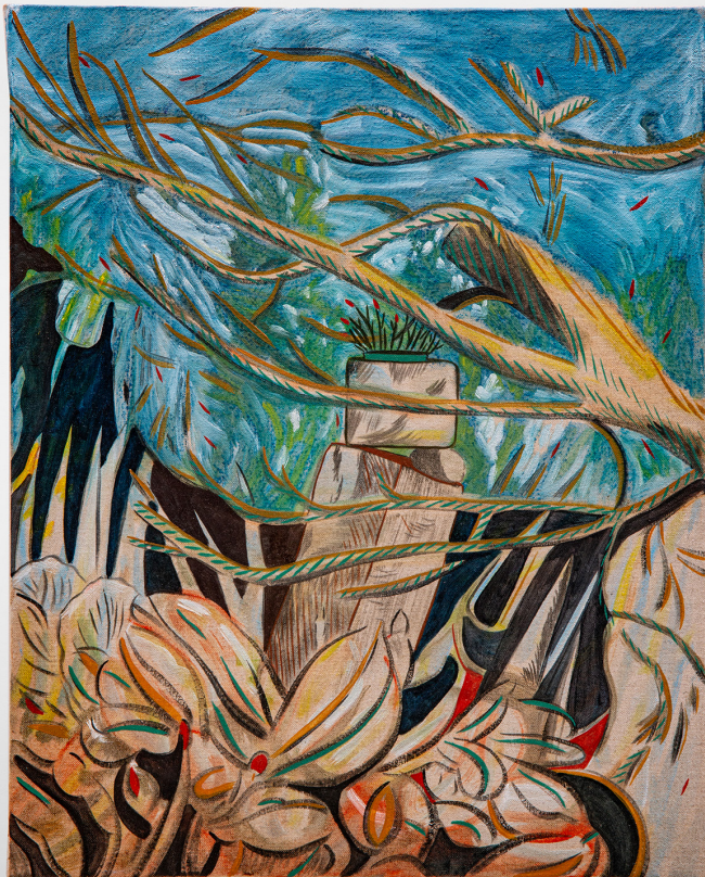
Giulia Mangoni, Sotto la mimosa , 2025 55 x 45 cm, oil on linen, courtesy the artist and ArtNoble Gallery. Ph. credit Jacopo Rufo