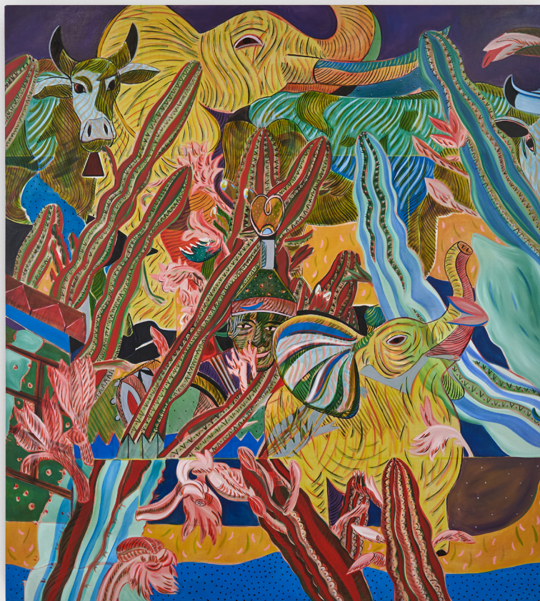
Giulia Mangoni, Transumanza al mercato , 2024 200 x 180 cm, oil on linen, courtesy the artist and ArtNoble Gallery. Ph. credit Michela Pedranti